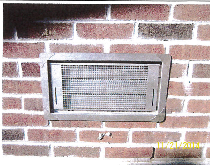
Vent View – Date of Photograph: (See Photo Stamp)